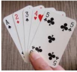
Using a deck of cards